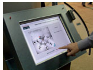
Creating and Implementing convention directories and information broadcasts is simplified.

SpotMagic's pilot project for 36 Circle K stores in Phoenix AZ offered a rotating 10 minute block of POP video commercials surrounded with news, weather, sports headline text, pictures and graphics gathered from Web Sources and configured for local markets and branded for individual retail locations.